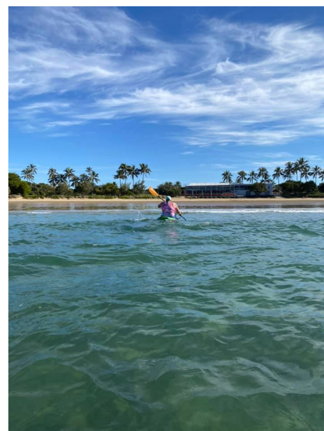
Enjoying the pristine beaches.